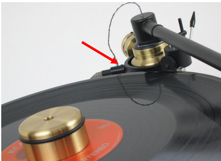
Fig. 4. See cable fixing