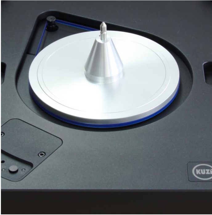
Fig. 6. Belt drive with subplatter