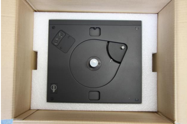
Fig. 1a. Lowest level- turntable base

The whole turntable is packed in one box. Before unpacking the individual parts of the turntable, prepare the area where the unit will be situated. The best position is on a solid shelf which is strong and rigid enough to support the turntable. For best performance this should be completely horizontal. Fig. 1a,b,c.