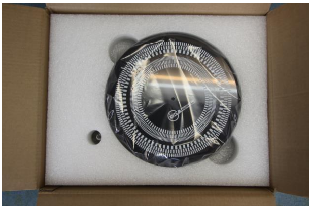
Fig. 1c. Top level- platter,....