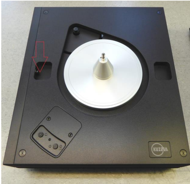
Fig. 2. Turntable Stabi R base without right wing

Comes mounted with left side panel attached( Fig. 1a). The base is heavy ( Fig. 2.) Lift it, being careful not to scratch against metal parts of clothing, and position it in the middle of the supporting board. You can now level the base horizontally with a spirit level. Level base by rotating two opposite legs at a time.( Fig. 3. )