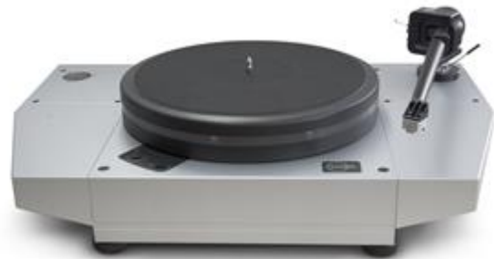
Stabi RD – for two tonearms