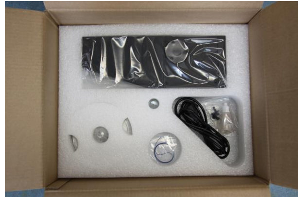
Fig. 1b. Middle level- arm wing,....