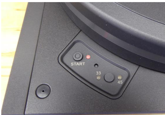
Fig. 8. Top panel – no platter rotation