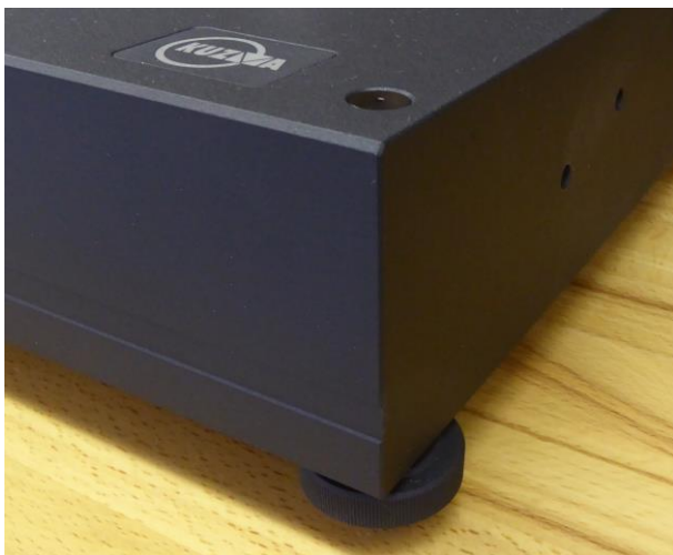
Fig. 3. Levelling adjustment foot