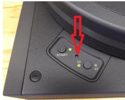
Fig. 8A. Two green LED showing 33 rpm