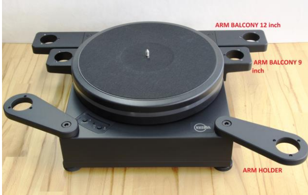
Various tonearm options