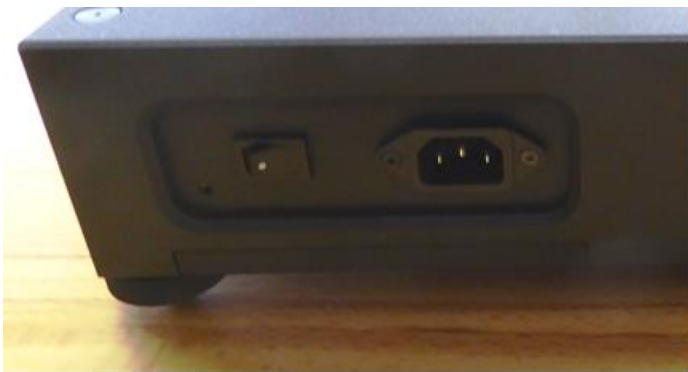
Fig. 7. Rear panel with mains switch

Be sure you have a turntable with the correct voltage and mains cable for your country. Connect the mains cable at the rear of the turntable, then into to the mains and then switch on the at the rear, which is then left permanently on. Fig. 7. A red LED will light up on the top of the panel. Fig. 8&8A