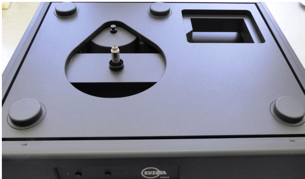
Fig. 3. Top plate in the outer frame with 4 height knob adjustments

Then, by nearly touching the edge of the well with the dropper, allow the rest of the oil to slowly run along the shaft into the lower well. Have a tissue handy in case of oil spillage. Clean your hands in case of oil contamination. Gently position the subplatter over the shaft and slowly lower it down. A small amount of oil & air might escape from the hole on the slope. If so, wipe it. Gently rotate the subplatter a few times, lift it up half way and lower it again. It should rotate smoothly. Fig. 3&3A.