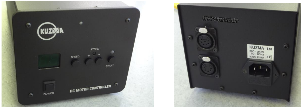
Fig. 6 DC power supply