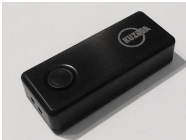
Fig. 8. Remote control

With PS DC we supply a remote control with battery already inserted ( 1 pc 12V V23GA). This will allow you to start or stop the platter from your listening seat by aiming in the direction of the PS DC. Press and hold start/stop button for 3 sec. Both Start/Stop lights will change accordingly. Fig. 8.