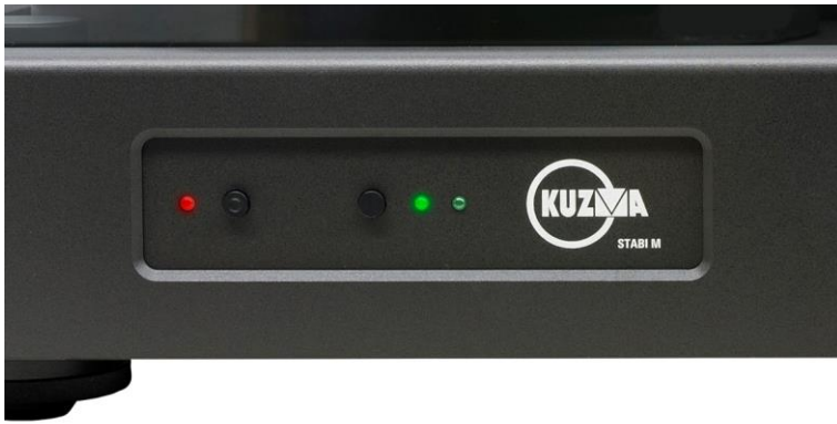
Fig.7. Front panel: Left- Start/Stop, Right- Speed Selection ( left LED 33, right LED 45 )