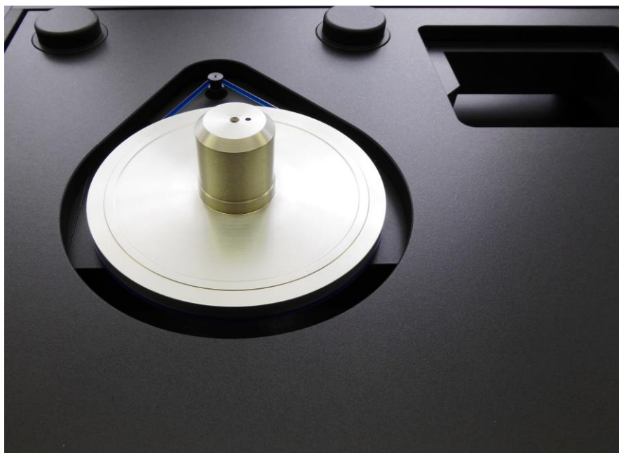
Fig. 3A. Top plate with subplatter and belt