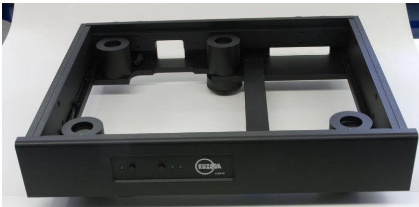
Fig. 2. Turntable outer frame

The outer frame of the turntable, which has four decoupling towers, is heavy. Lift it, being careful not to scratch against metal parts of clothing, and position it in the middle of the supporting board. You can now level the main frame horizontally with a spirit level. Rotate the front legs only. The rear leg is fixed. Fig. 2.